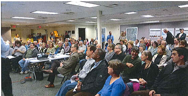
Photo of the May 22, 2017 Public Information Meeting at Plainville Public Library

You are receiving this notice because your property is near the preliminary preferred alignment for the trail, or one of the potential alternates.